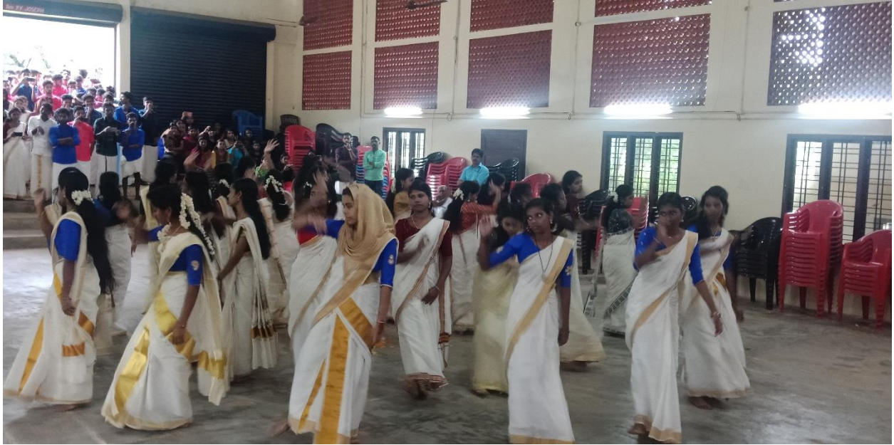
Arts Fest “Atharvanni 2019” (7 th February 2019)